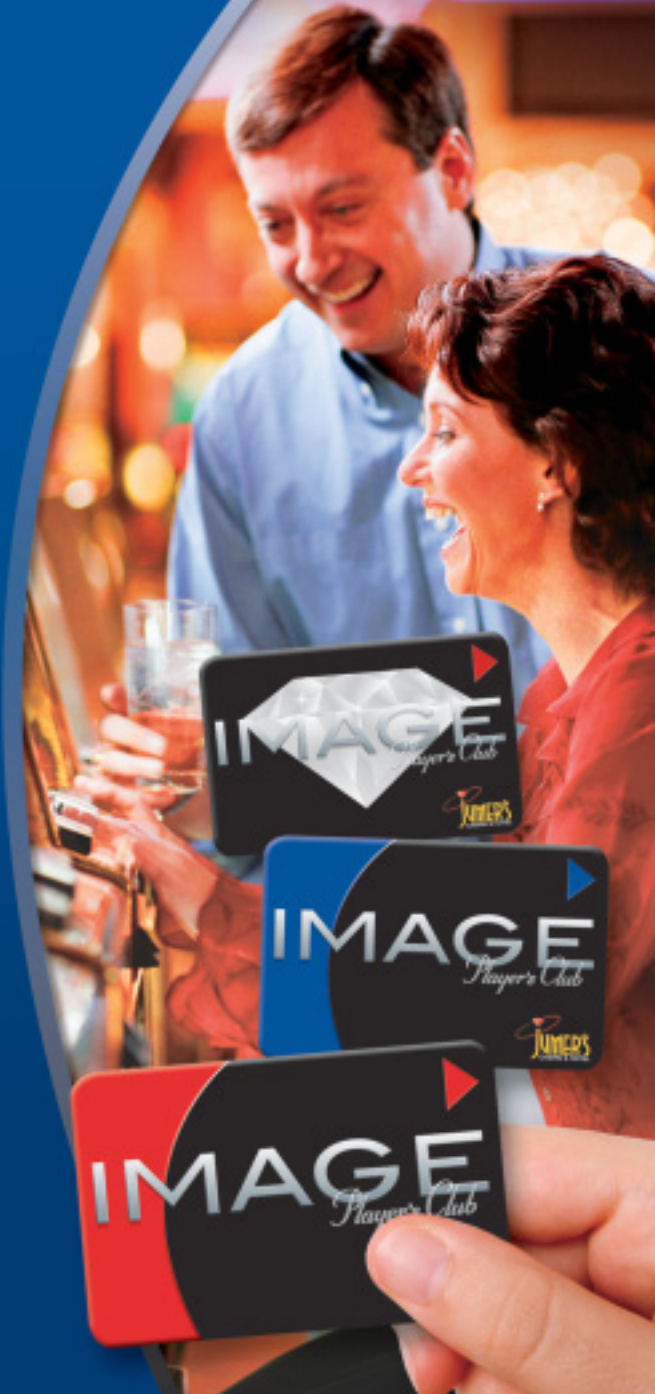
IMAGE Player's Club

If you or someone you know has a gambling problem, crisis counseling and referral services can be accessed by calling 1-800-GAMBLER (1-800-426-2537).